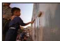
1990.V1. Cub Scouts serving the community.