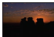
1990.V3. A daylong hike usually ends with spectacular sunsets and a hearty meal.